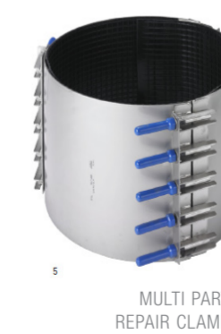
MULTI PART REPAIR CLAMP