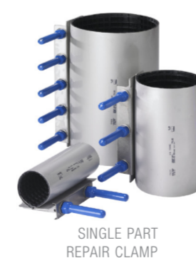
SINGLE PART REPAIR CLAMP