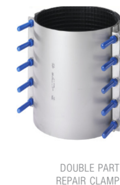
DOUBLE PART REPAIR CLAMP